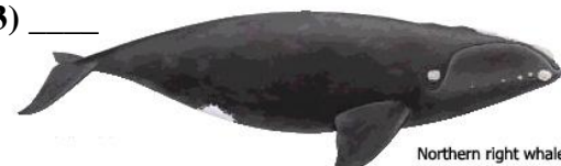
Northern right whale